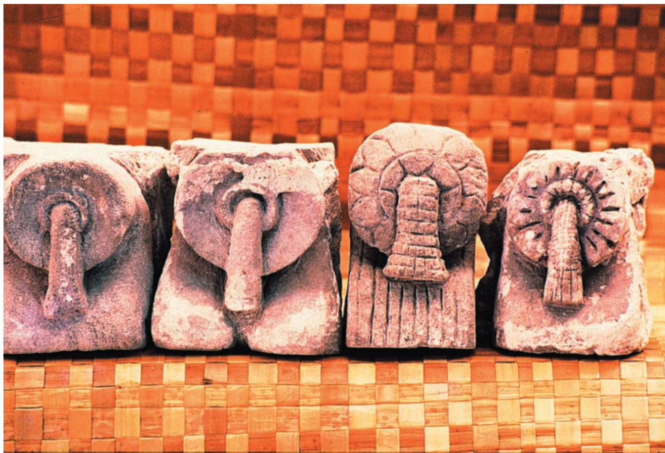
Coral stone carvings of elephants

Each of the four intricately carved coral stones depicts an elephant. The main feature of each stone is the prominence given to display the elephant's trunk. These elephant-faced coral stone carvings, belonging to the Maldives' pre-Islamic society, are among the few items in the National Museum linking the Maldives' to its pre-Islamic period. At present, the Museum does not display these items. These items were considerably damaged- as was the case with many other similar items of the pre-Islamic era- by vandals who had mercilessly attacked the coral-stone sculpture collection in the Museum.