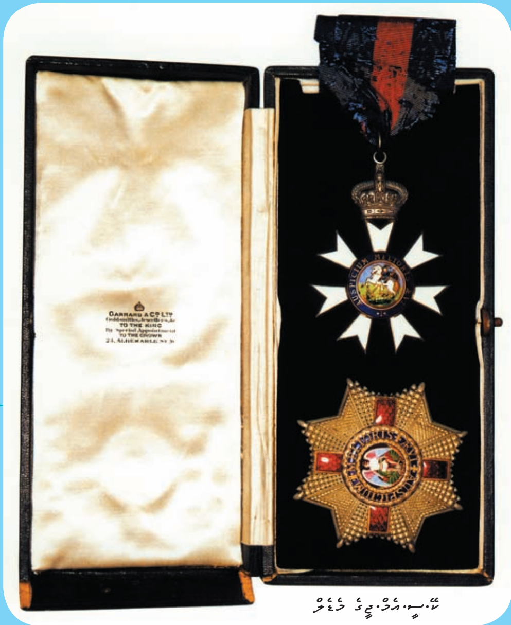
ސ.ސ.ރ.ގެ ފުރަތަމަ ފެންނަ ސަލާމަތު

“ސ.ސ.ރ.ގެ ފުރަތަމަ ފެންނަ ސަލާމަތު ދަރިކަލިޔަވަހީގެ ފުރަތަމަ ފެންނަ ސަލާމަތު، ސަލްޅަން ޞަނުގުއްދީން ޞަނުގުއްދީން (2) ނެވެ. ނެވެ. 20 ޖުމްހޯރިއްޔާ 1938 ގައި ނެވެ. ނެވެ. ޖުމްހޯރިއްޔާގެ ދަރިކަލިޔަވަހީގެ ފުރަތަމަ ފެންނަ ސަލާމަތު، ސަލްޅަން ޞަނުގުއްދީން ޞަނުގުއްދީން (1) ދަރިކަލިޔަވަހީގެ ފުރަތަމަ ފެންނަ ސަލާމަތު، ނެވެ. ނެވެ. 24 ޖުމްހޯރިއްޔާ 1962 ގައި ނެވެ. ނެވެ. ސަލްޅަން ޞަނުގުއްދީން ޞަނުގުއްދީން (3) ދަރިކަލިޔަވަހީގެ ފުރަތަމަ ފެންނަ ސަލާމަތު، ނެވެ. ނެވެ. 14 ޖުމްހޯރިއްޔާ 1972 ގައި ނެވެ. ނެވެ. ނެވެ. ސަލްޅަން ޞަނުގުއްދީން ޞަނުގުއްދީން ޞަނުގުއްދީން ނެވެ. ނެވެ. ޖުމްހޯރިއްޔާގެ ދަރިކަލިޔަވަހީގެ ފުރަތަމަ ފެންނަ ސަލާމަތު.”