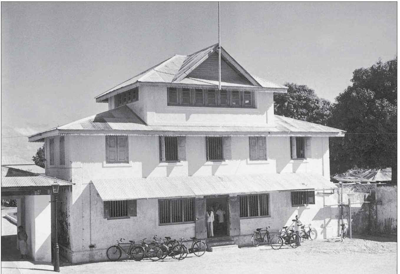
5. 2014 15 - DHIVEHI DIGEST 21