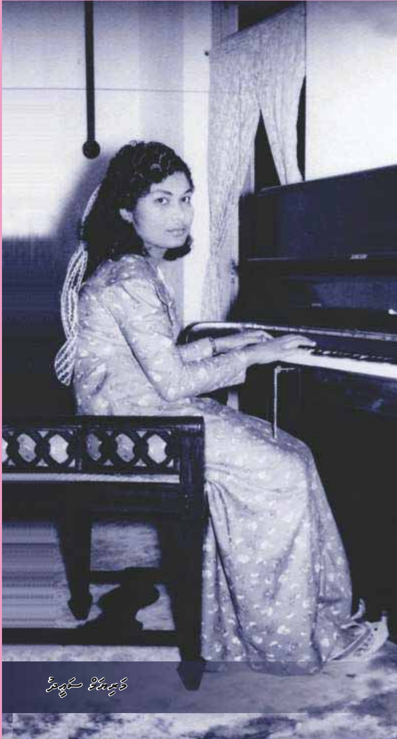
މި ފަތަވާ ގަވާއިދު ގަވާއިދު